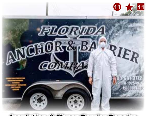
Insulation & Vapor Barrier Repairs Soft Floor Repairs & Laminate Flooring

Wishing you good health and safety, The Florida Anchor & Barrier Team